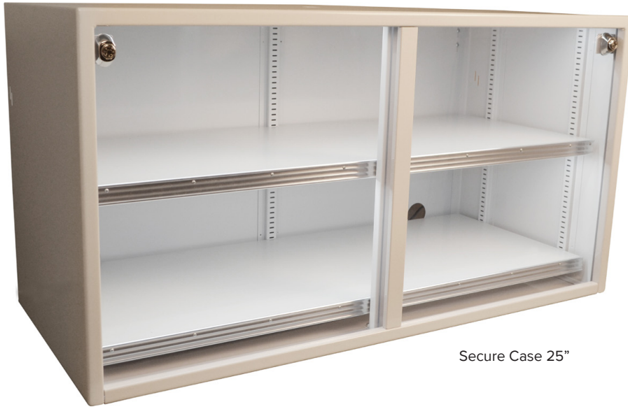
Secure Case 25"